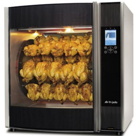
STG 7 Intelligent

The STG's interior and exterior are stainless steel. Its magnetic double glass doors open with a gentle click. All removable parts are coated with the Fri-Jado XP450 coating. With this 3-layer, highly durable non-stick coating, cleaning your equipment is truly a piece of cake!