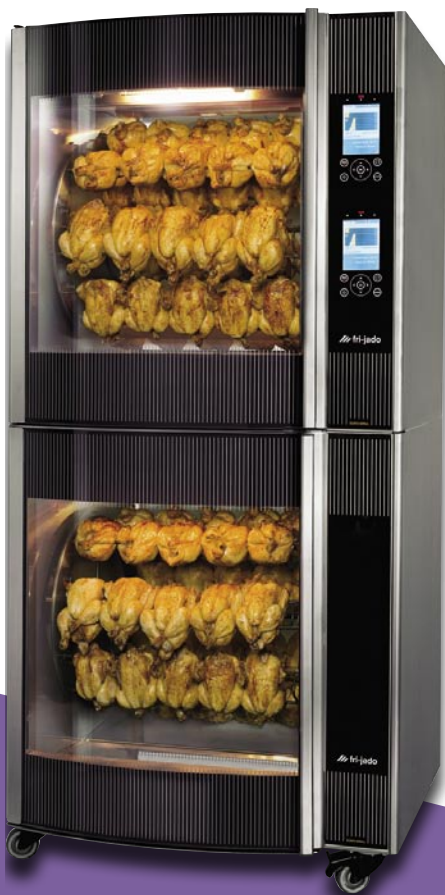
STG 7+7 Intelligent